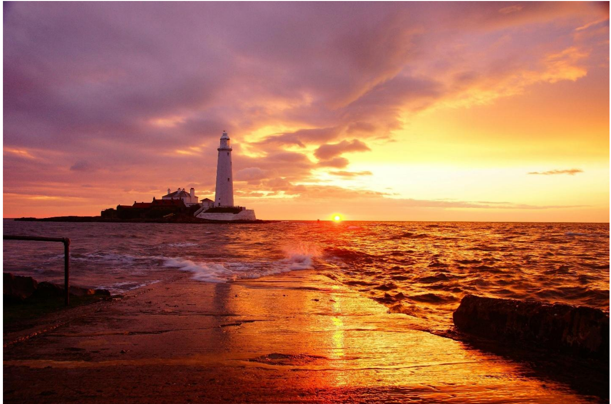
Five-Day Devotional: Ever-Present and Unchanging — Meditations on some Attributes of God July 28–August 1, 2025